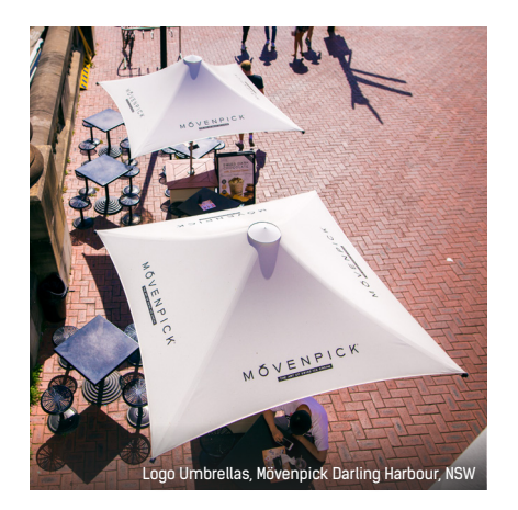
For more information visit www.makmax.com.au