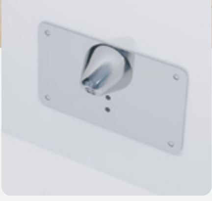
Sensor Op Tepid Water Basin Outlet Code: DET5071A-660B