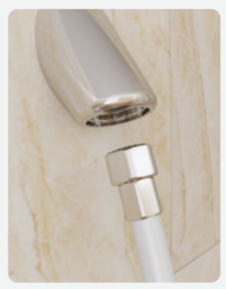
Shower Rose & Removable Shower Head Code: CNHNDSHHS-D