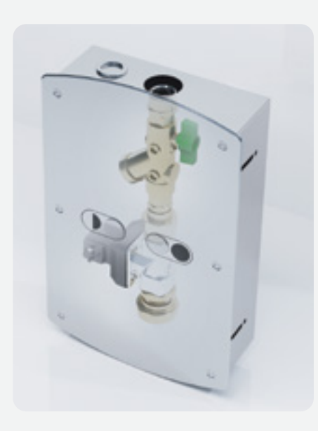
Restore Toilet Flush Valve Code: RH413S