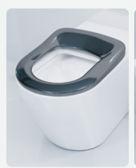
Wellbeing 800 Floor Mounted Back-to-Wall Toilet Pan

Safe and secure design providing a comfortable showering experience. Unique design allows for easy room adaptation to accommodate carer's hand showers with no additional diverter.