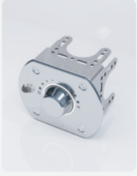
Restore Shower Control Panel Code: RHMIXBT