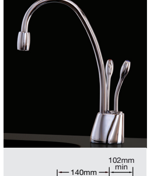
HC1100 Hot & cold filtered water