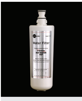
F-701R filter will come standard with all taps. It is a chlorine, taste and odour filter with additional lead protection and a scale reduction capability. It filters sediment at a 5 micron level. Sold as a replacement filter in a two pack carton.