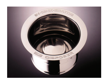
Extended flange For use with sinks greater than 20mm thickness.