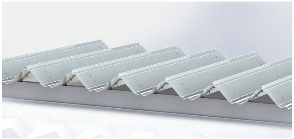
Figure 2: Typical connection showing use of connection plates.