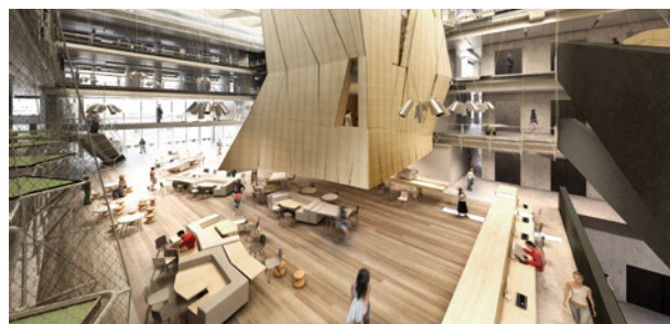
The University of Melbourne, Faculty of Architecture, Building and Planning Development