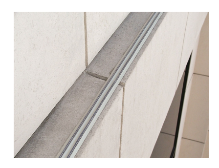
Suits most architectural features