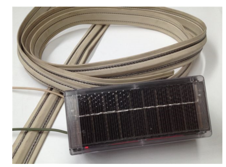
AVEPRO Shock Track Beige and Solar Charger