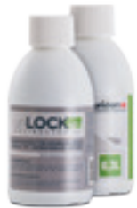
uriLOCK - pharmaceutical grade, biodegradable blocking fluid