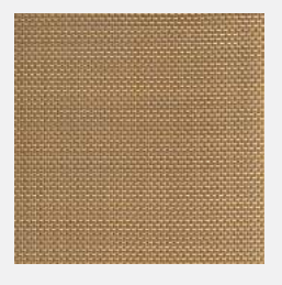
PR Copper 140/50 with Silver Mirror