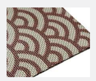
PR 260/50 Red Pattern