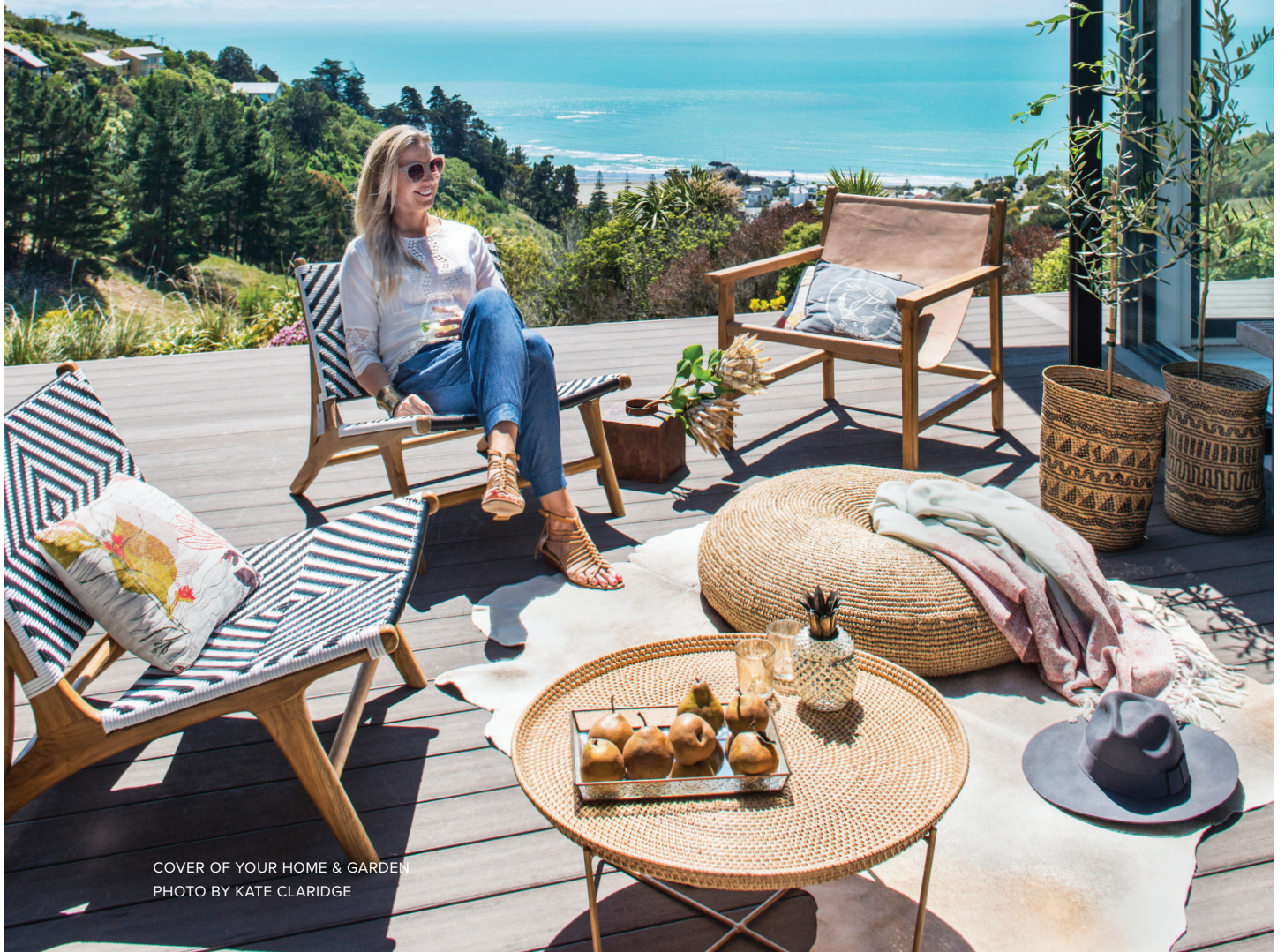
COVER OF YOUR HOME & GARDEN

PREMIUM PRODUCTS & SYSTEMS WITH AN EMPHASIS ON STYLE & DURABILITY