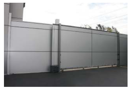
Customised sliding gates