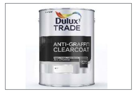
Anti-Graffiti top coatings available