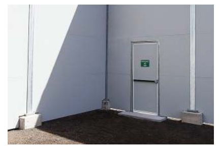
Pedestrian gates / doors