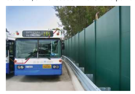
Acrylic paint - spray or roller application

The system once installed is ready to accept any self-priming acrylic paint (no additional primers needed). Where graffiti may be a concern, a final coat of Anti-Graffiti paint is recommended.