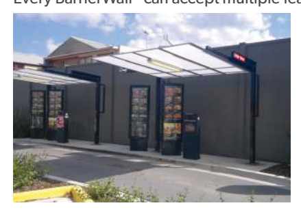
Fast food drive-through application

Every BarrierWall<sup>™</sup> can accept multiple features such as lighting, intercoms, cameras, feature panels or acrylic screens.