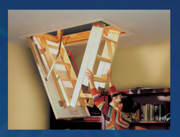
European made Breezway Fakro Access Ladders give safe, easy access to additional storage space.

European made Breezway Fakro Skylights open up rooms to allow natural light and fresh air in.