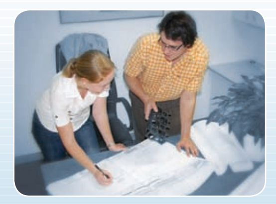
Call our technical department to assist you with your enquiries

We have offices and partners around the world and our team of environmental engineers, landscape architects and biologists have years of collective experience in the field.