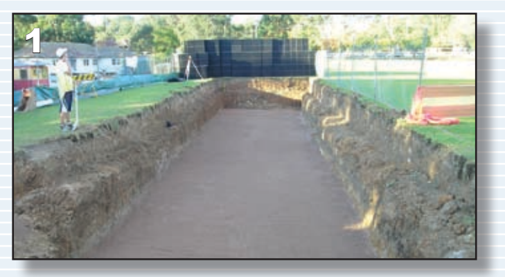
Excavation and Leveling.