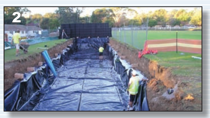
Installing Liner for Water Retention.