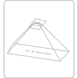
The 90/30 degree lens version of the D900 Cube brings new innovation to luminaire design. With a rectangular beam 3x longer than it is wide, it is ideal for hallways and lighting solutions in other long spaces.