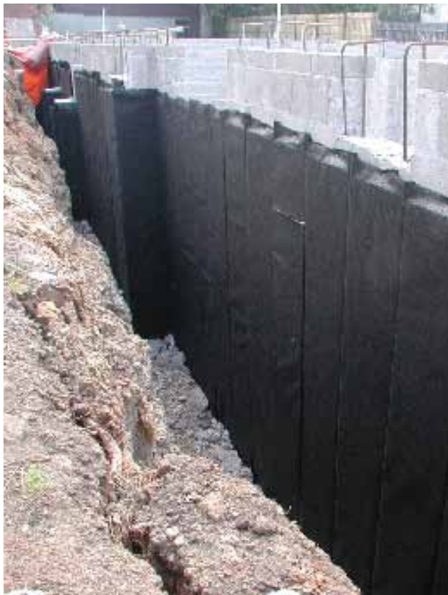
Fully wrapped 30mm wall panels installation.