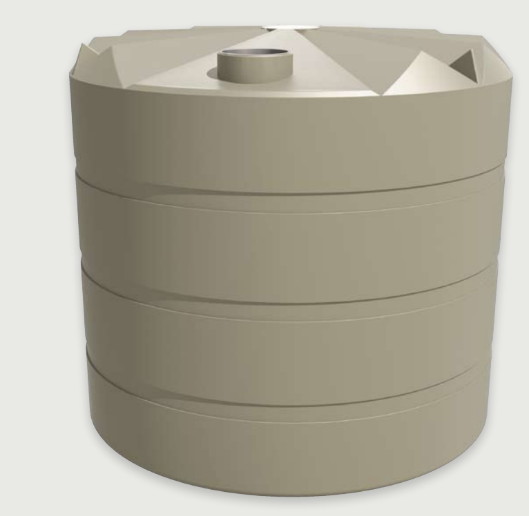
5000L Round Banded (Birch Grey)