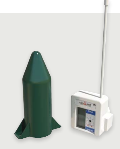
Rain Harvesting Wireless Level Indicator

Stop leaves and other debris from clogging the downpipes, with a dedicated Rain Harvesting Leaf Collector. Comprised of two stainless steel mesh screens filtering inflow, the Rain Harvesting Leaf Collector is one of the most effective means available for keeping out leaves, mosquitoes and vermin.