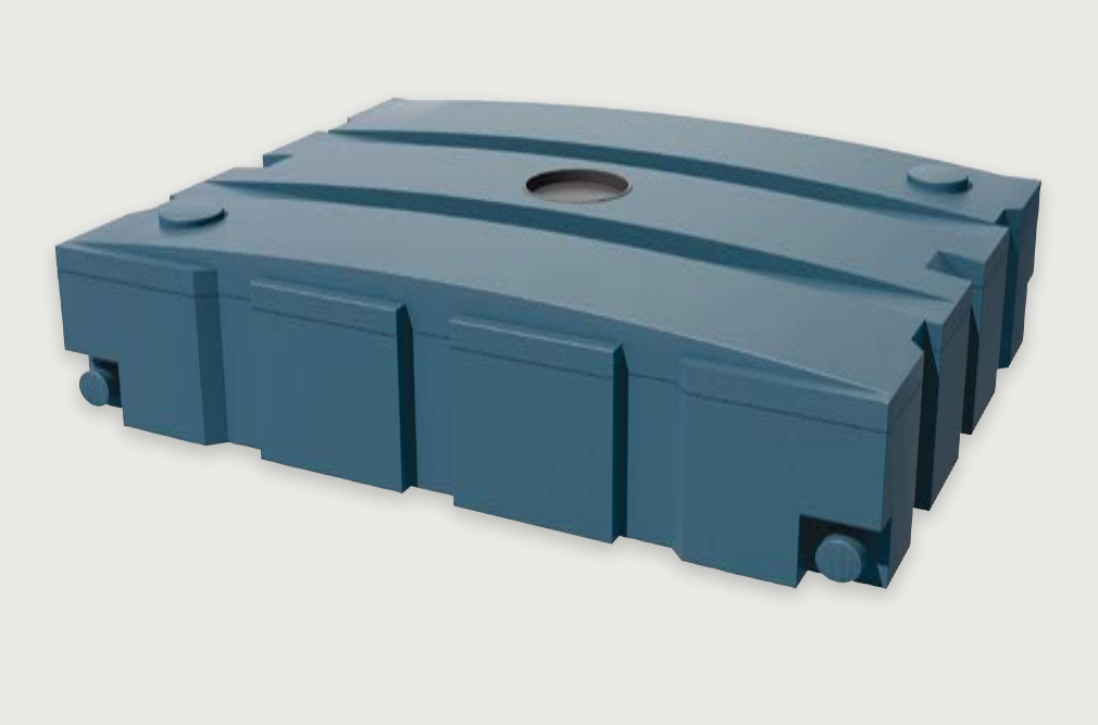
2000L Underdeck Smooth (Mountain Blue)