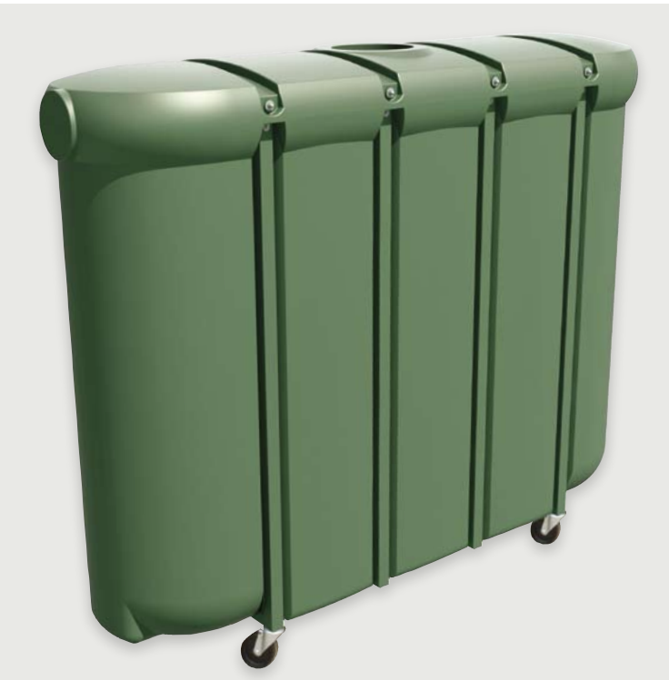
2500L Slimline Smooth (Mist Green)