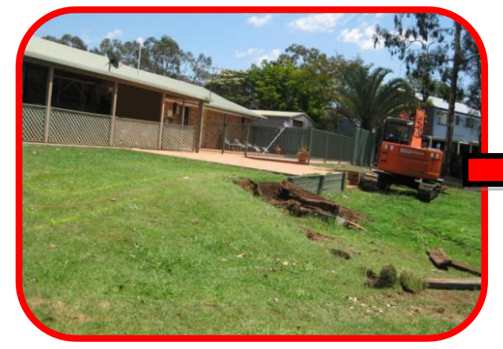
Day 1 (AM) Mark Out & Cut