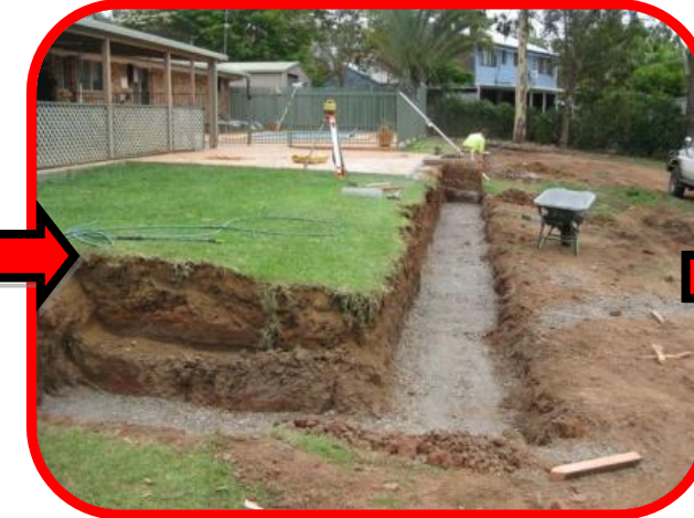
Day 1 (AM) Crusher Dust