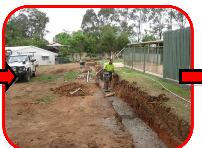
Day 1 (AM) Compacting Base Course