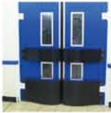
• Traffic Doors