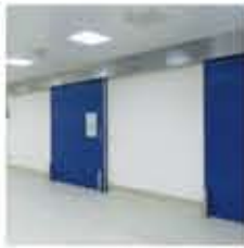
• Sliding Hygienic Doors