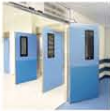
• Hinged Hygienic Doors