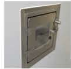
• Transfer and Trolley Hatches

Acoustic Doors Coldstore Doors Fire Doors FRP Doors Glass Doors GRP Doors Hermetic Doors Hygienic Doors Rapid Roll Doors Sliding Doors Traffic Doors Transfer Hatches Waterproof Doors Windows X-ray Doors