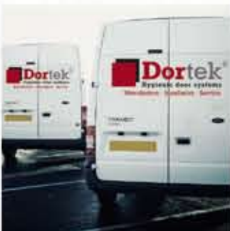
Service & Maintenance