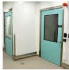
• Fire Rated Hygienic Doors