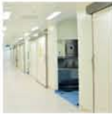
• X-ray Rated Doors