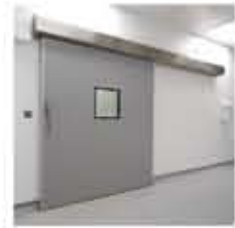
• Hermetically Sealing Doors