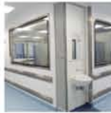
• Windows and Vision Panels