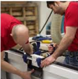
Installation & Commissioning