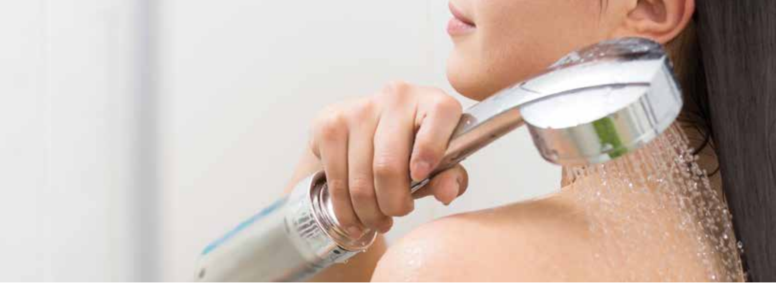
"Saving energy and lowering my running costs for hot water is important. With a heat pump from STIEBEL ELTRON I enjoy the benefits of energy efficient hot water – even when the sun isn't shining"