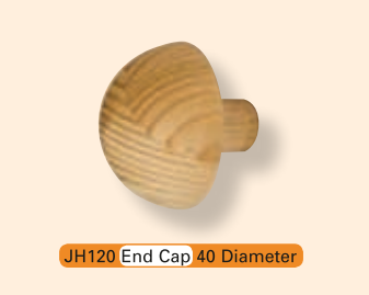
Available ex-stock in Pine & Tas Oak/Vic Ash. Other timbers manufactured against order.