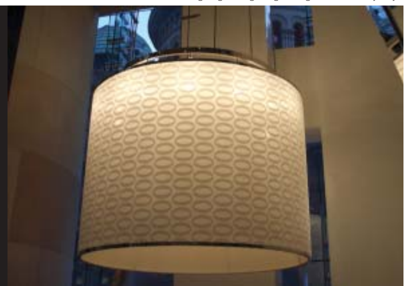
Examples of polished and electroplated finishes supplied to Planet Lighting and Ogis Engineering for the Hilton Sydney .