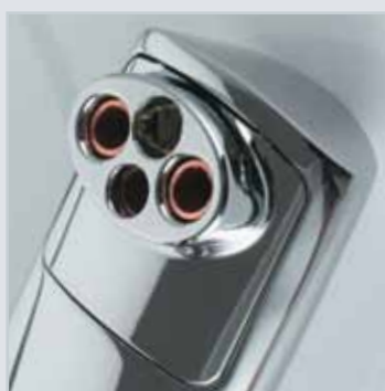
DRIP-FREE DESIGN FOR CLEANER WORK AREAS