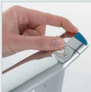
SAFETY LOCK REQUIRES TWO-FINGER OPERATION FOR BOILING WATER