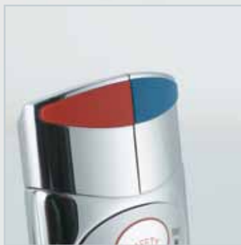
READY AND FILTER LIGHTS ADVISE WHEN WATER IS BOILED OR WHEN FILTER REQUIRES REPLACING