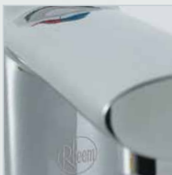
QUALITY CHROME PLATED CAST METAL BODY FOR STYLE AND DURABILITY