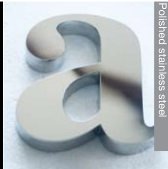
Polished stainless steel