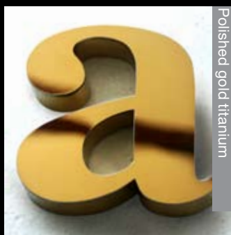
Polished gold titanium