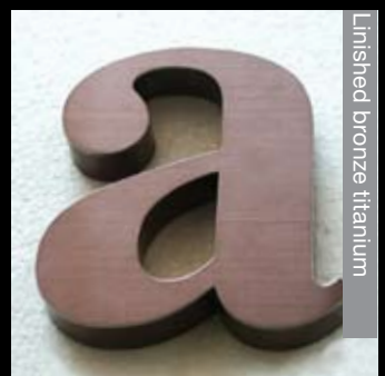
Linished bronze titanium

Sign Industries 9 Lennox Street Moorabbin 3189 Victoria Australia T 613 9555 9694 F 613 9555 7579 info@signindustries.com.au www.signindustries.com.au