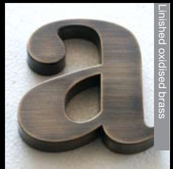
Linished oxidised brass