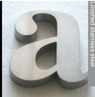
Linished stainless steel