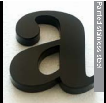
Painted stainless steel