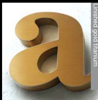
Linished gold titanium