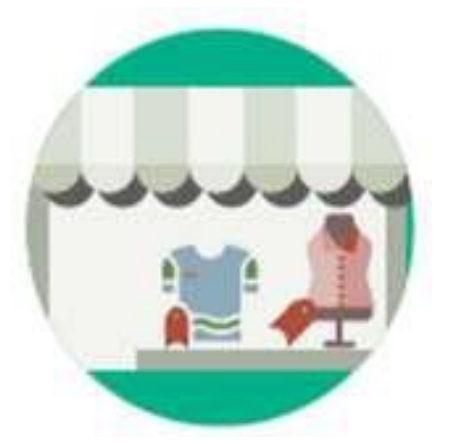
Retail Stores & Commercial Fitouts

Any project requiring a quick, clean and cost effective fit out with the highest quality porcelain – be it a new build or renovation.