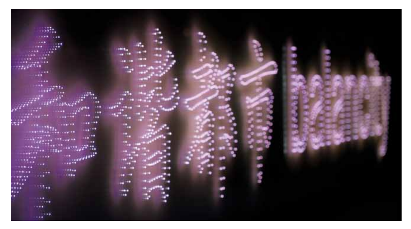
SCHOTT MAGIRA® LightPoints LED glass at the German Pavilion "Balancity" at EXPO 2010 in Shanghai