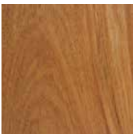
New Guinea Rosewood