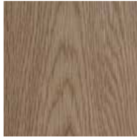
American White Oak