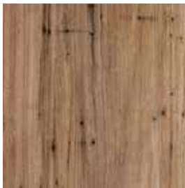
Blackbutt - feature