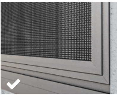
The new Hidden Fix Frame has the screws concealed under the frame. Once capped, screws are concealed for a streamlined, stylish finish