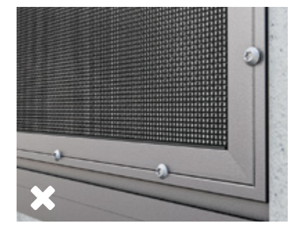
Traditional face fix methods leave unsightly visible screws