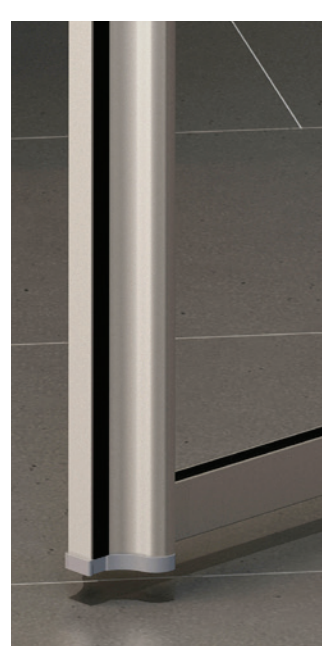
Full Length Captive Magnet