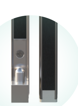
Folds flat against the wall in both directions