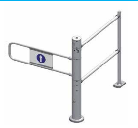
Single radar & safety rails