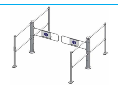
Single RH PE beam tandem