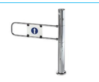
Single RH radar

Additional posts and barrier rails can also be supplied to suit any application.