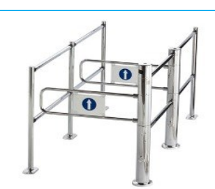
Single RH radar tandem