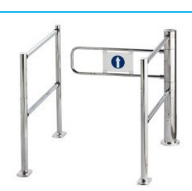
Single RH PE beam