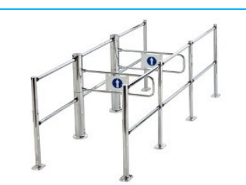
Double PE beam back lane