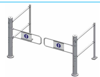
Double radar back lane