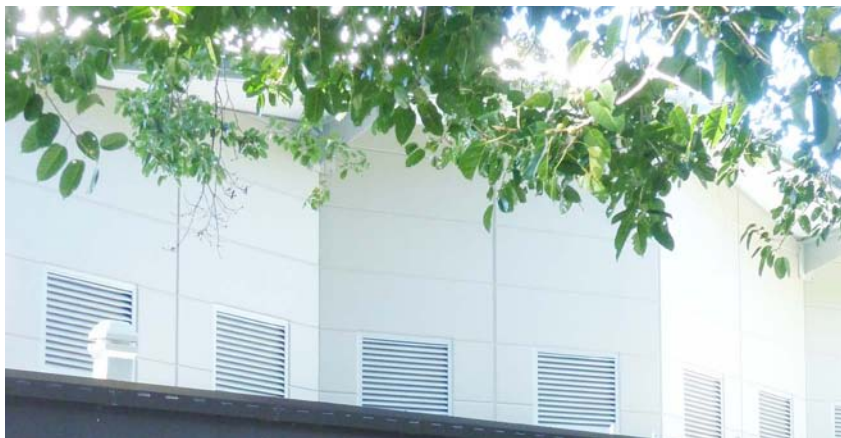
Redland Bay State School