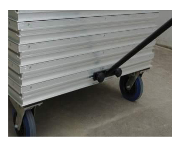
When all Podiums and Accessories are packed onto the Trolley, add the Trolley Handle then secure the load with the Strapping.