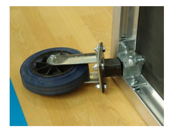
Replace Stage Legs with Trolley Wheels.