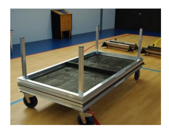
Stack Podiums and Legs onto Trolley Base, remove the Legs and lay in the Podium recess.