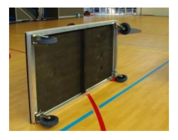
Insert all 4 Wheels and hand tighten.