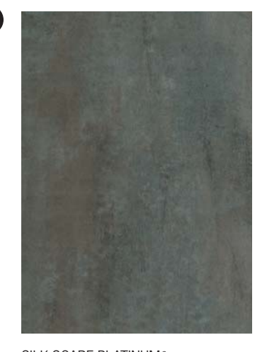
SILK SCARF PLATINUM<sup>2</sup> – 3L120625