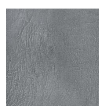
KINDERLLOY SMOKED ALUMINUM<sup>6</sup>