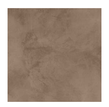
RAW CRETE PARADISO4