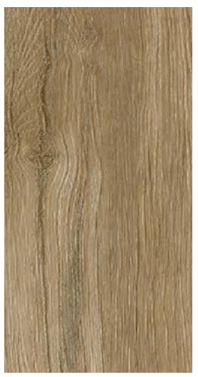
BARNYARD GREY<sup>1</sup> – 3L120825