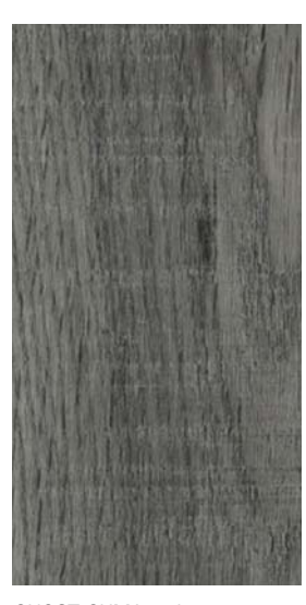
GHOST GUM3 - 3L093606