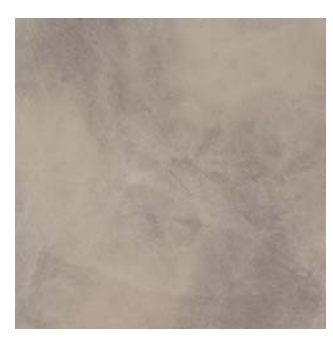
RAW CRETE WARM STONE<sup>4</sup>