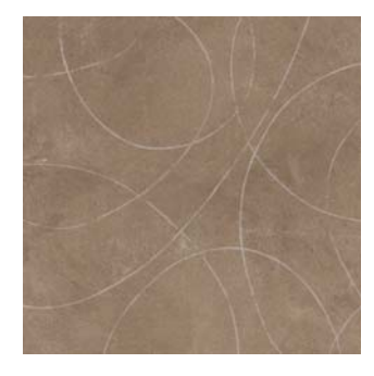
METAL CRETE PARADISO4