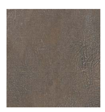
KINDERLLOY BRONZE PATINA6