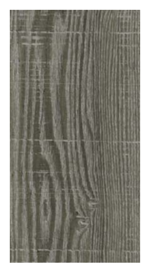
PAPER BARK<sup>3</sup> – 3L161111