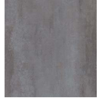
SILK SCARF PLATINUM<sup>2/5</sup>