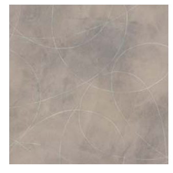
METAL CRETE WARM STONE<sup>4</sup>