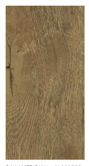
OAK AMERICAN<sup>1</sup> – 3L220525