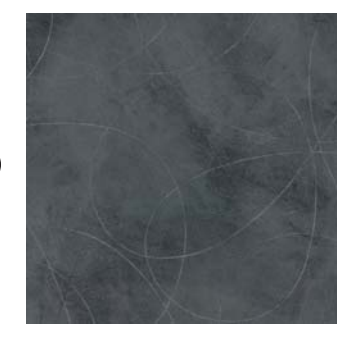
METAL CRETE IGNEOUS ROCK4