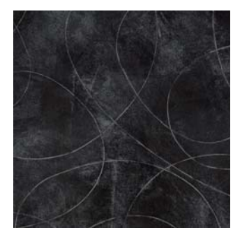
METAL CRETE BLACK KNIGHT<sup>4</sup>