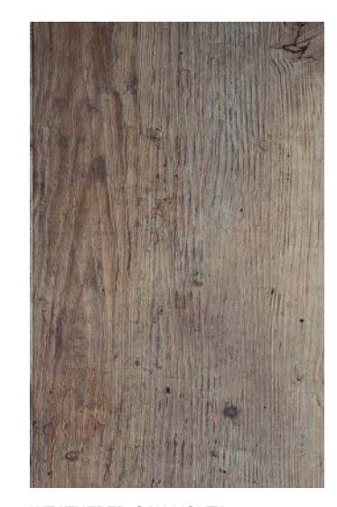
WEATHERED OAK LIGHT<sup>2</sup> – 3L000026