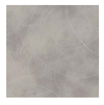
METAL CRETE COOL STONE<sup>4</sup>