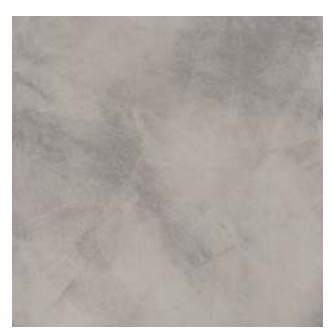
RAW CRETE COOL STONE<sup>4</sup>