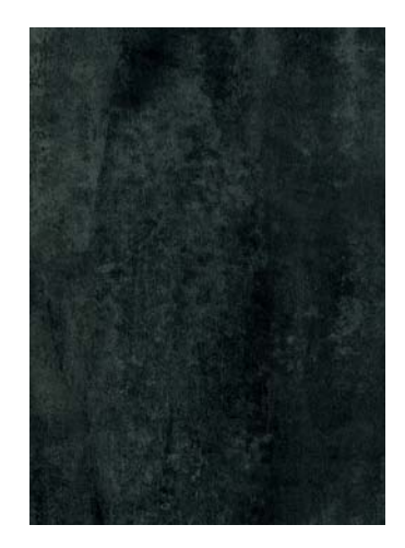
SILK SCARF BLACK SILVER<sup>2</sup> – 3L120525