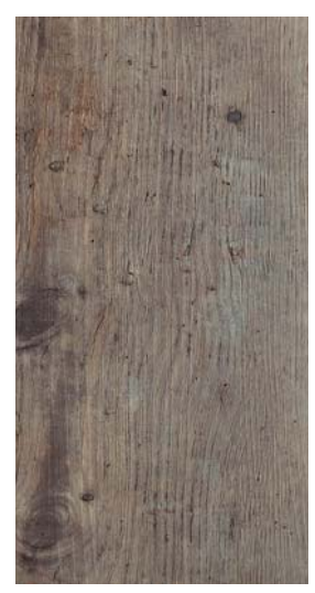
WEATHERED OAK LIGHT<sup>1</sup> – 3L121025