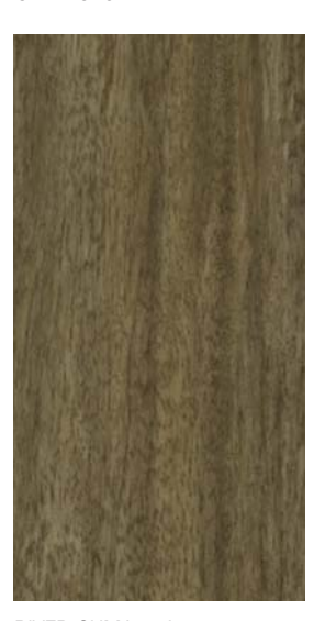
RIVER GUM3 - 3L450806