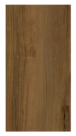
PERUVIAN WALNUT — MAYAN GOLD<sup>1</sup> — 3L121125