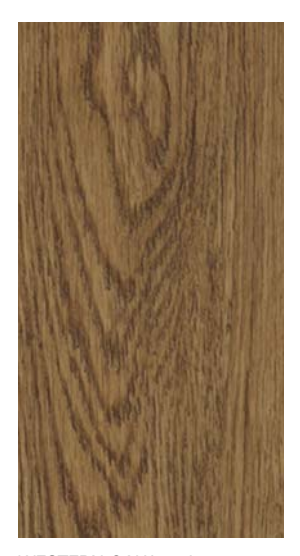
WESTERN OAK3 - 3L164513