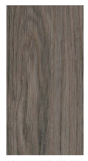
ROAN OAK DRIFTWOOD GREY<sup>1</sup> – 3L121225