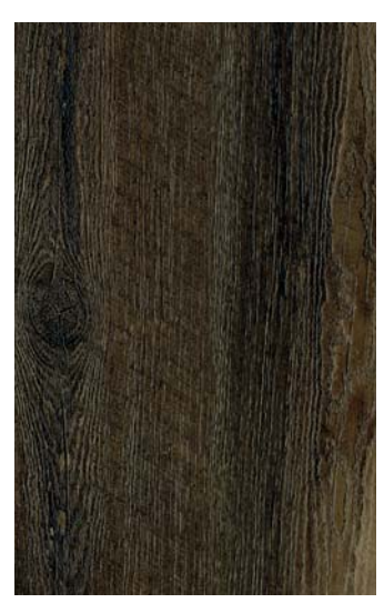
BARNSIDE EMBERS<sup>2</sup> – 3L110325