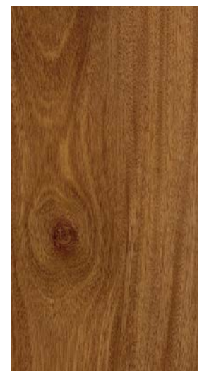
AMENDOIM – NATURAL<sup>1</sup> – 3L121325