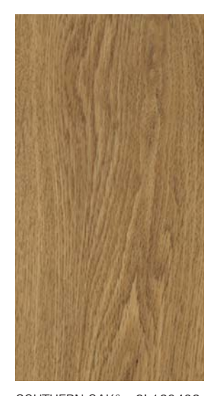
SOUTHERN OAK3 - 3L160402