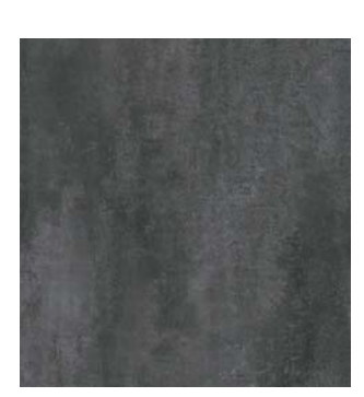
SILK SCARF BLACK SILVER<sup>2/5</sup>