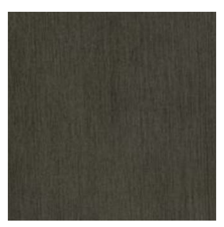
MOROCCO LICORICE<sup>4</sup> – 3L400077