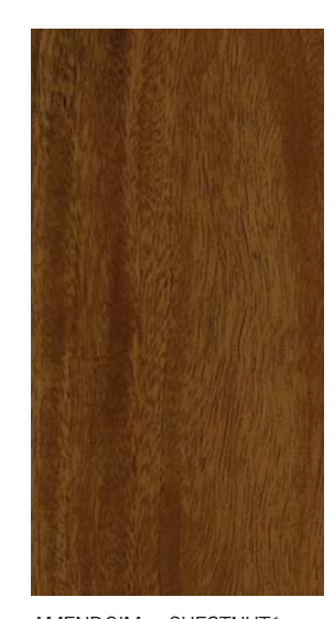
AMENDOIM – CHESTNUT<sup>1</sup> – 3L121425