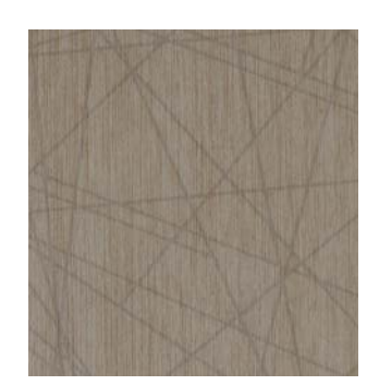
FLIGHT PATH NATURAL4