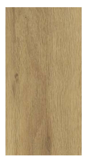
OAK BLONDE1 - 3L170513