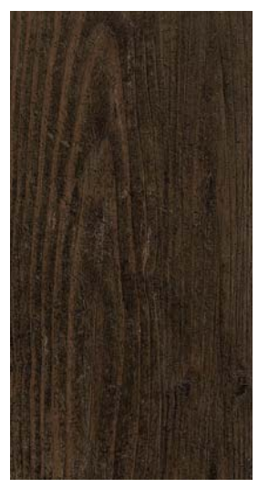
FACTORY FLOOR FLAX SEED<sup>1</sup> – 3L120725