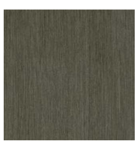
MOROCCO CLOVE<sup>4</sup> - 3L400079