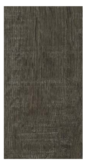
IRON BARK<sup>3</sup> – 3L093607