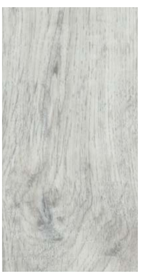
SNOW GUM3 - 3L093601