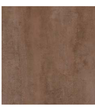
SILK SCARF COPPER BLUSH<sup>5</sup>