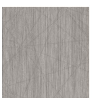
FLIGHT PATH GREY BEIGE1/4