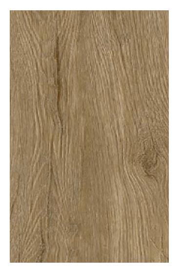
BARNYARD GREY2 - 3L110225