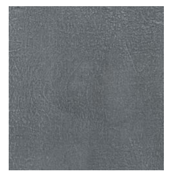
KINDERLLOY BLACKENED LEAD<sup>6</sup>