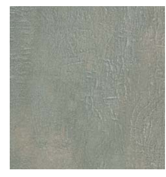
KINDERLLOY COPPER VERDIGRIS<sup>6</sup>