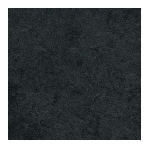
GRANITE BLACK<sup>4</sup> – 3L161708