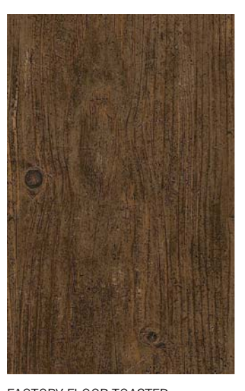
FACTORY FLOOR TOASTED SESAME<sup>2</sup> – 3L120425