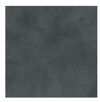
RAW CRETE IGNEOUS ROCK4