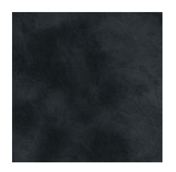
RAW CRETE BLACK KNIGHT<sup>4</sup>

Lead time is approximately 12-14 weeks from placement of order.