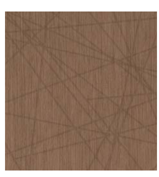
FLIGHT PATH WARM BROWN<sup>4</sup>