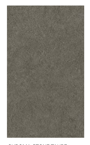
CHROMA STONE TAUPE<sup>1</sup> – 3L131825