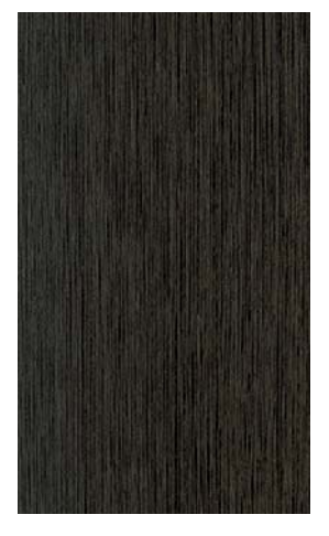
ARIA CHARCOAL<sup>1</sup> – 3L210125