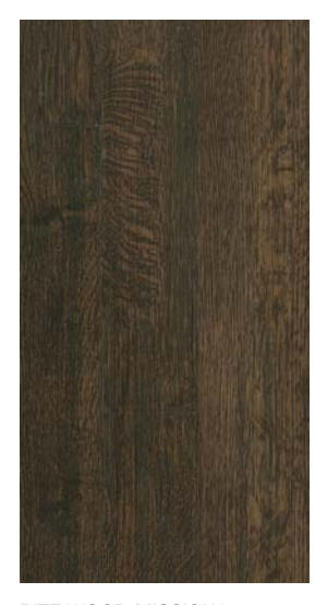
RITE WOOD MISSION<sup>1</sup> – 3L131525