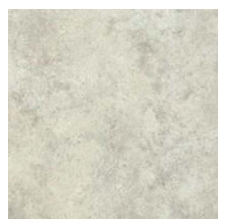
SIERRA SOFT WHITE4 - 3L400539