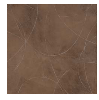
METAL CRETE HENNA STONE<sup>4</sup>