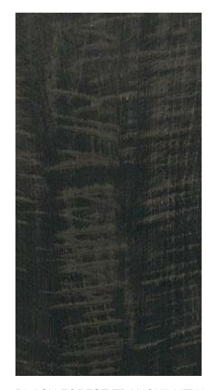
BLACK FOREST TRANQUILLITY<sup>1</sup> – 3L120925