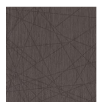
FLIGHT PATH CHARCOAL1/4

Lead Time is approximately 12-14 weeks from placement of order. Contact your Armstrong Flooring Representative or Customer Services 1800 632 624, customer_services@armstrongflooring.com for more information.