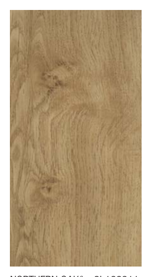
NORTHERN OAK3 - 3L168911