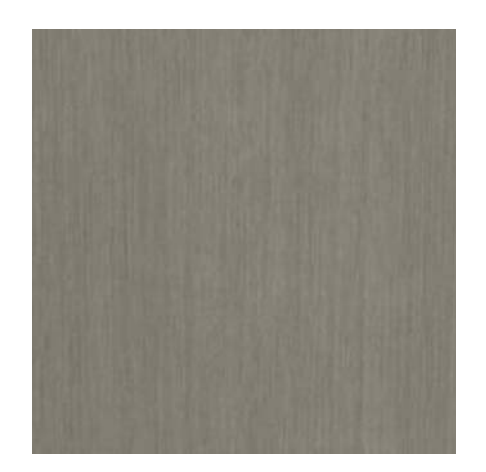
MOROCCO ANISE<sup>4</sup> – 3L400078