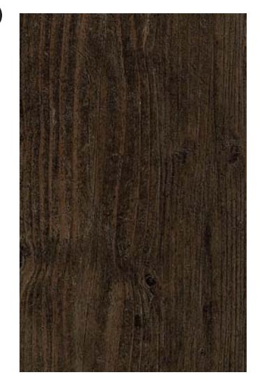
FACTORY FLOOR FLAX SEED<sup>2</sup> – 3L110125