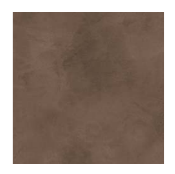
RAW CRETE HENNA STONE<sup>4</sup>