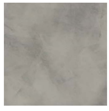
RAW CRETE COOL STONE4 - 3L400548