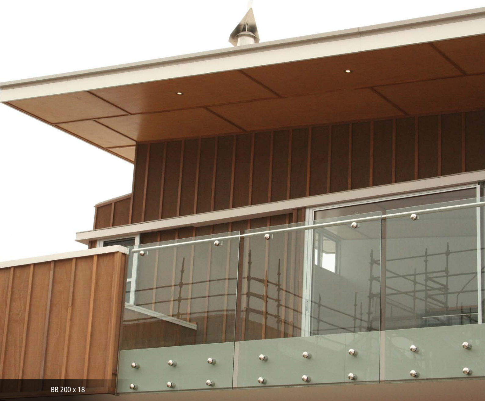
BB 200 x 18