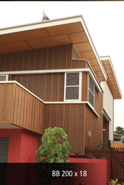
BB 200 x 18