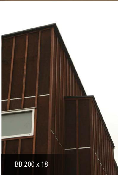
BB 200 x 18