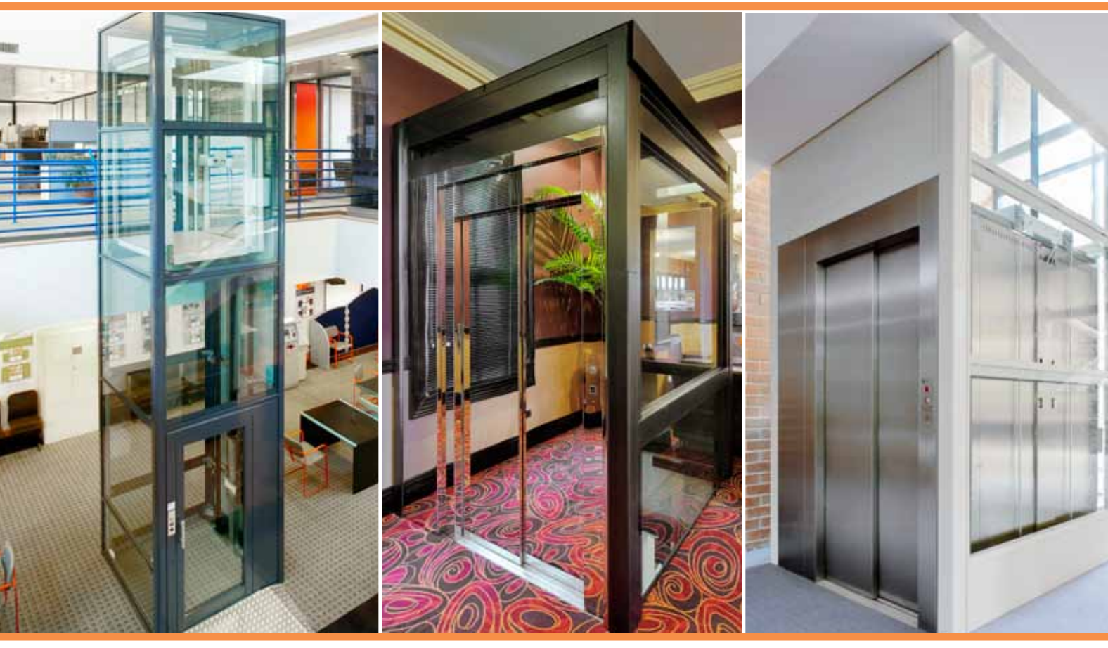
DOMUSXL LIFT 0-4 metres travel