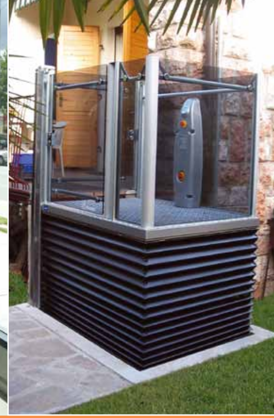
EASYSTEP PLATFORM LIFT 0-1 meters travel