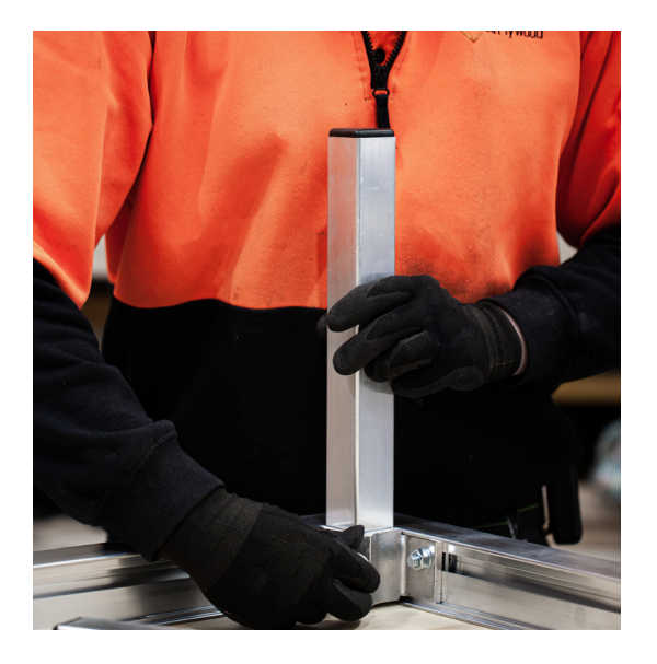
Insert the four Stage Legs and Hand tighten using the Wing Bolt.