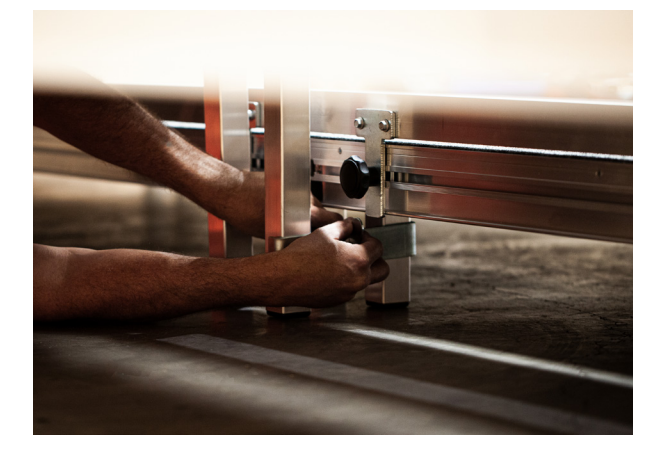
Leg Clamps can be added for extra stability to large Stages.