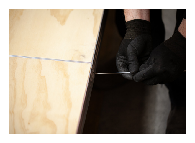
Lock the Klemm-fix Connector with the Allen Key Tool, Hand Tighten.