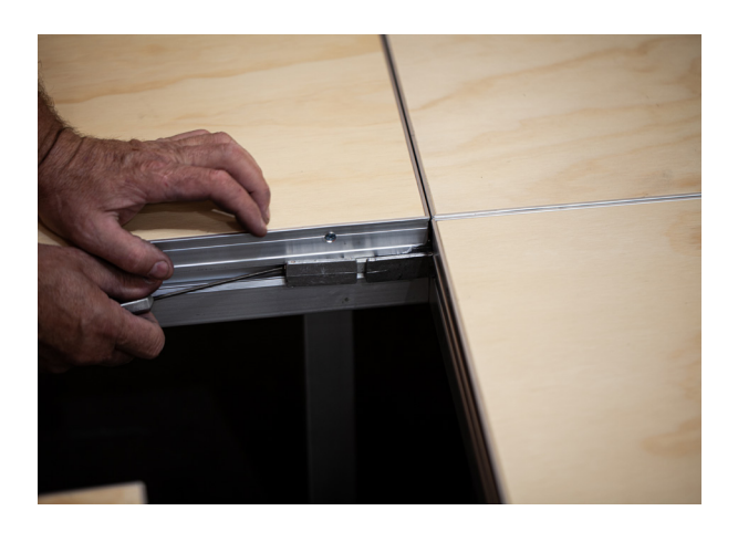
Insert Klemm-fix Connector the correct way up, going in just half way on Interior Podiums or the full way on Exterior Podiums.