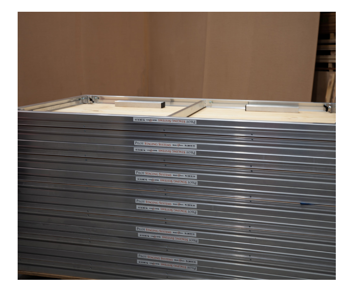
Move Stage Components to correct area using the Storage Trolley Kit. Turn the first Podium upside down.