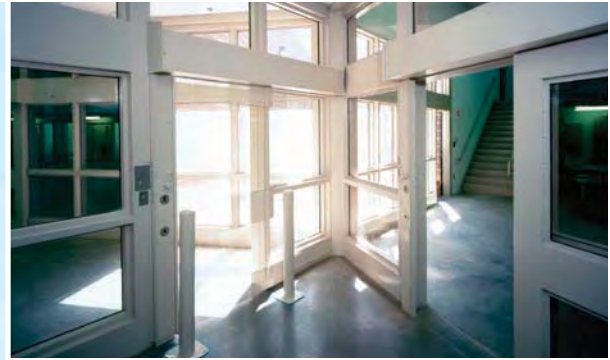
Prison Security Entrance:

Please note: that all measurements are converted from imperial and have been rounded.