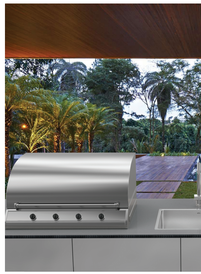
Please refer to BBQ cooker installation recommendations. Picture above has been created to showcase a TRESPA® top only.

Nover are now stocking a range of Trespa® Meteon® panels for use in alfresco applications. The external performance of Trespa® Meteon® provides peace of mind when manufacturing alfresco kitchens or any cabinets exposed to the elements.