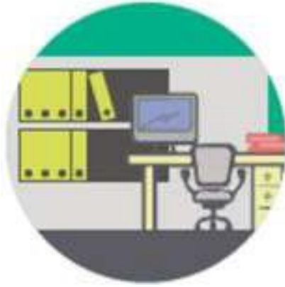
Offices, Bars & Restaurants