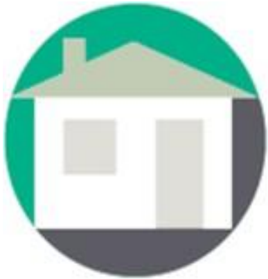
Homes, Hotels & Resorts