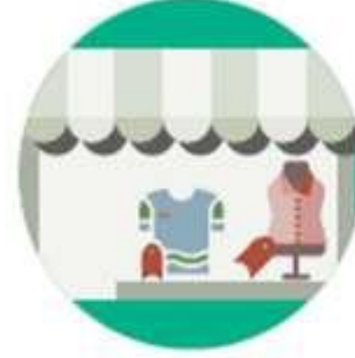
Retail Stores & Commercial Fitouts

Any project requiring a quick, clean and cost effective fit out with the highest quality porcelain – be it a new build or renovation.