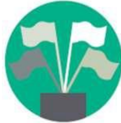
Exhibition Stands & Pop Up Shops