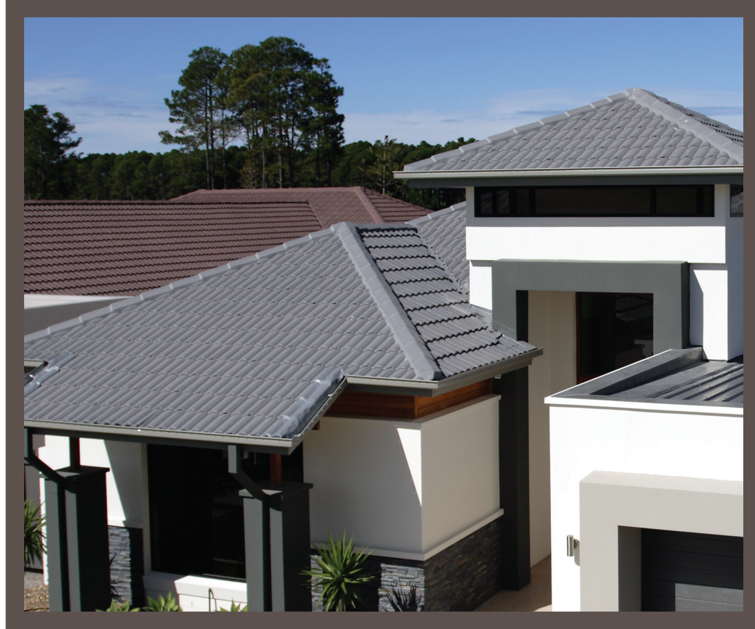
To view colour swatches for each state refer to www.monier.com.au

An ideal tile for enhancing both modern and Mediterranean designs, the prominent roll of Elabana's profile adds eye-catching style to your roof.