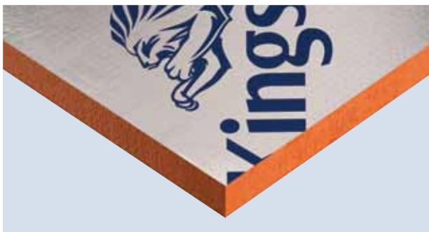
Figure 3 Super high performance Kingspan Kooltherm® K8 Cavity Board