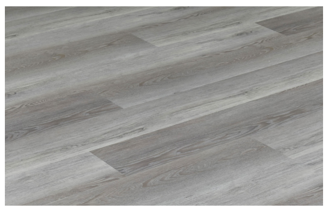
RIVER GUM SFC-105