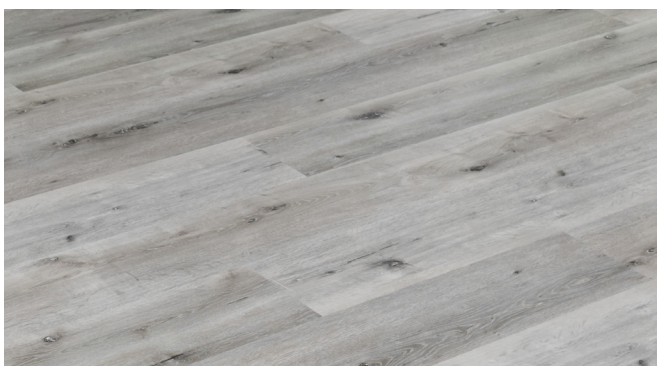
SWEDISH OAK SFC-125