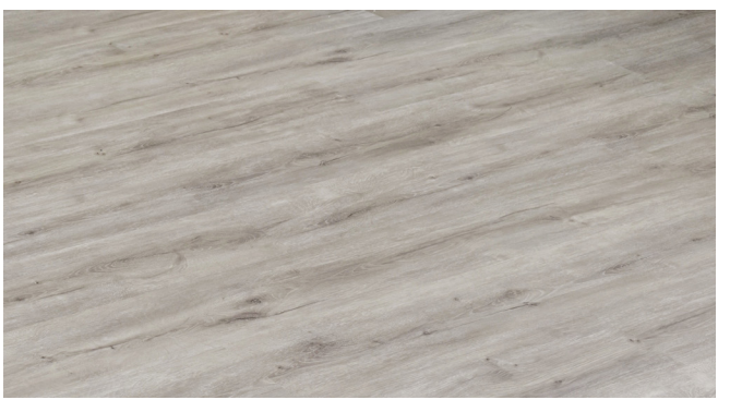
SILVER GUM SFC-114