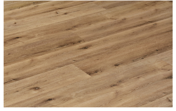
RUSTIC OAK SFC-101