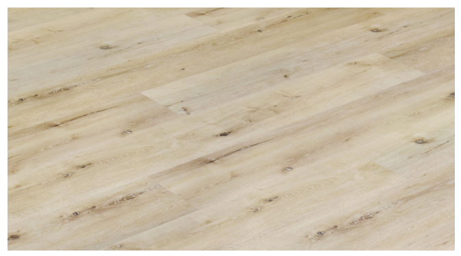
DANISH OAK SFC-121