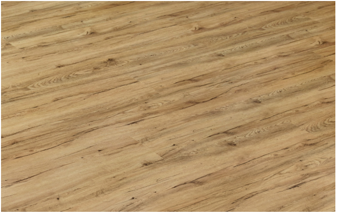
DISTRESSED OAK SFC-109