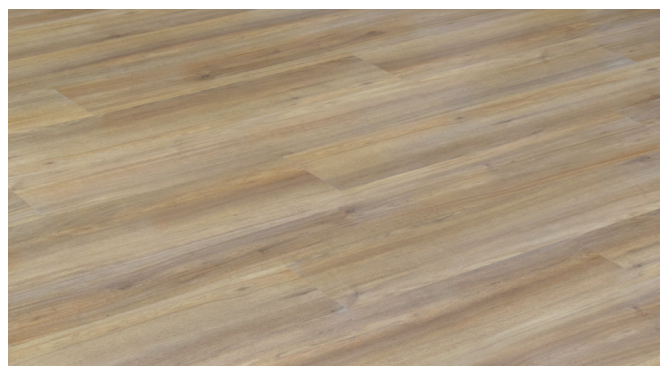
SPOTTED GUM SFC-131