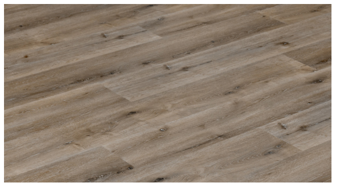
SPANISH OAK SFC-123