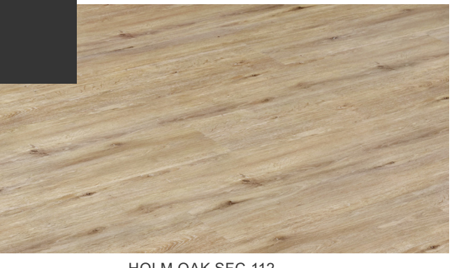
HOLM OAK SFC-112