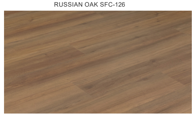
NSW SPOTTED GUM SFC-132