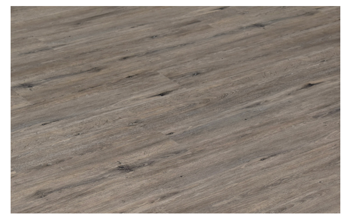
BLACK OAK SFC-111