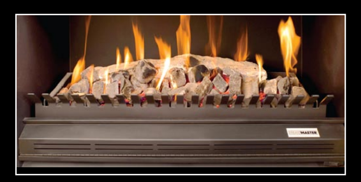
Gas Coal Fire