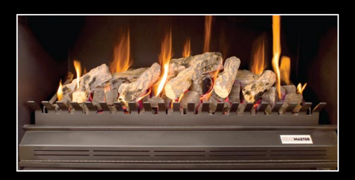
Gas Coal / Log Combination Fire