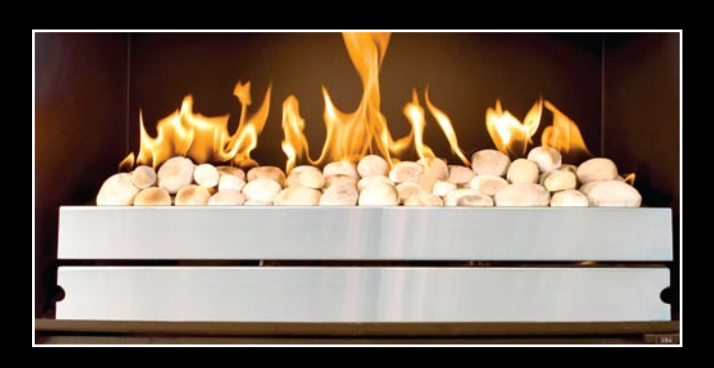
Gas Pebble Fire (pictured with optional stainless tray)