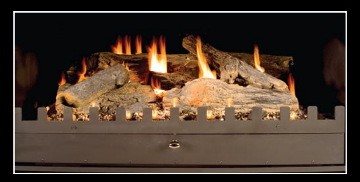
Gas Log Fire