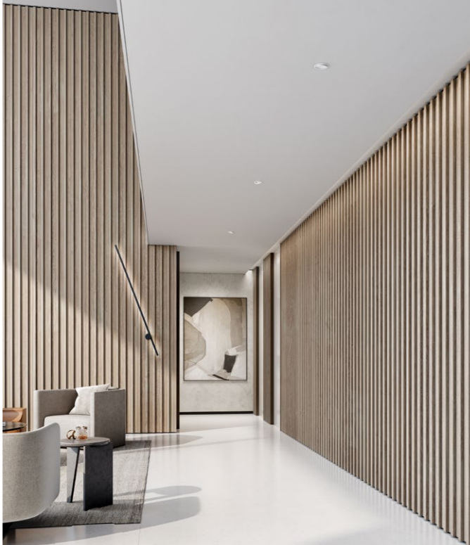
Board and Batten. Navurban™ Albany Oak