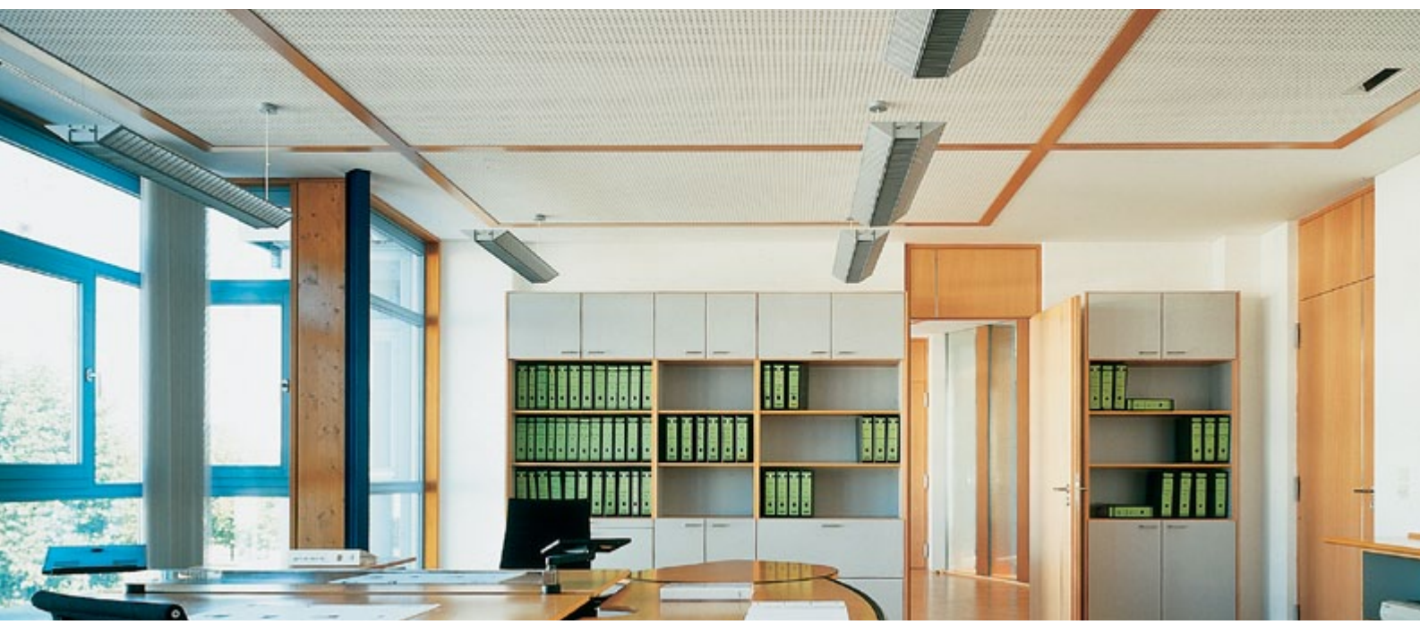
Click to go to VOC Certificates