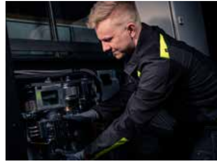
Day 2 – Installation Second day – The doors, shaft and platform cladding are installed, all electrics are plug & play and easy to connect.