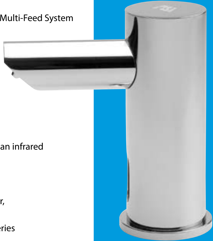
Heavy duty brass dispenser

The automatic soap dispenser uses an infrared sensor and a peristaltic pump: