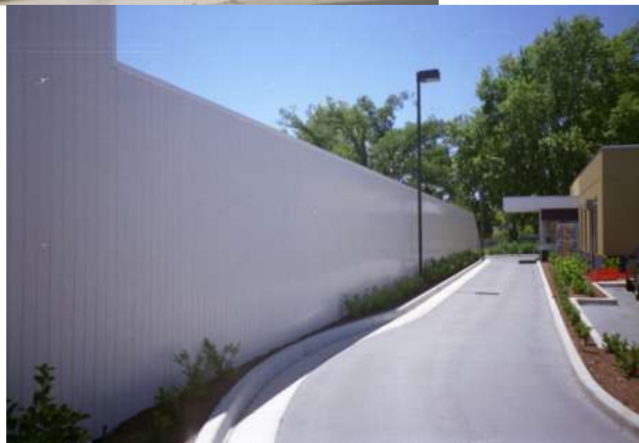
Manufactured by Poly Marketing Pty Ltd T/A