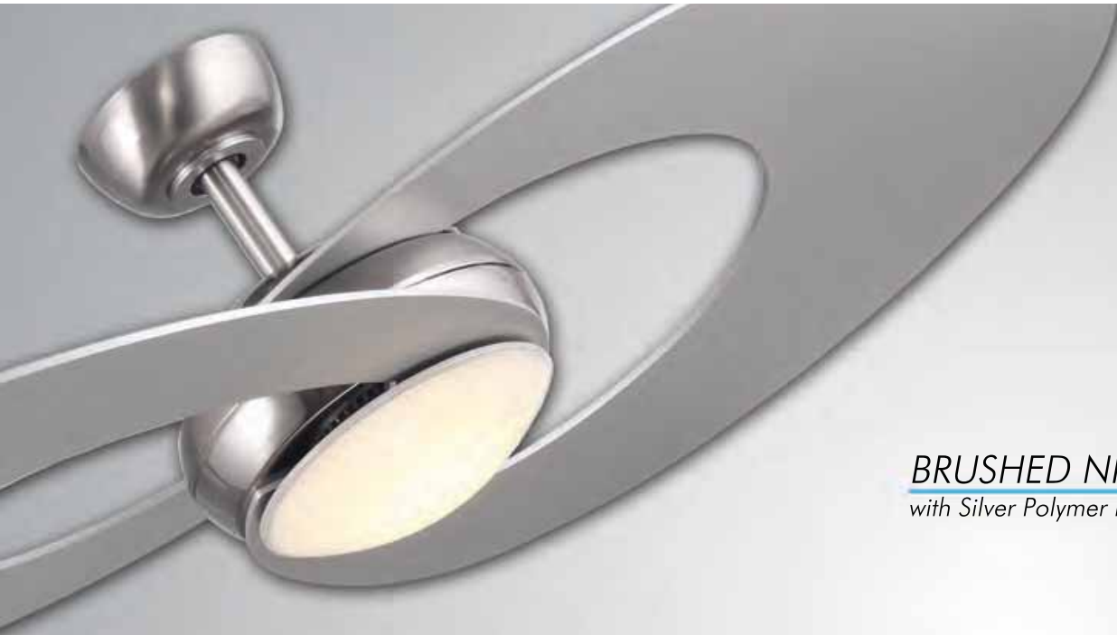
BRUSHED NICKEL with Silver Polymer Blades