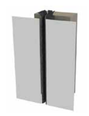
recess fixed (recommended 5mm gap between side guide and building material)