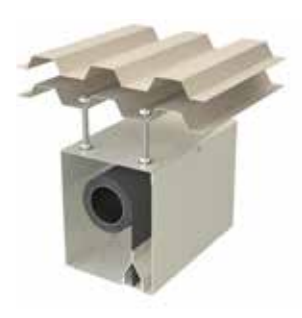
unistrut and drop rods