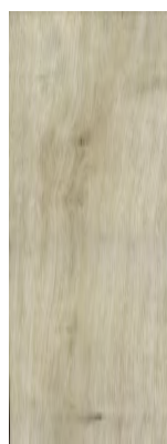
Rustic White Maple 24831 005