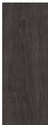
Smoked Oak Black 24831 001