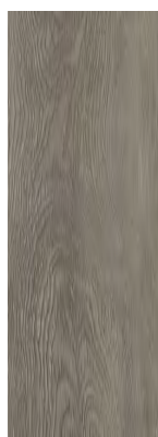
Grey Oak 24831 004