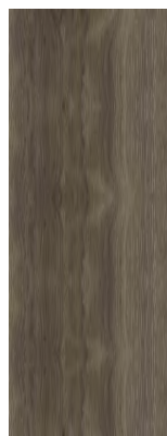
Brown Oak 24831 003