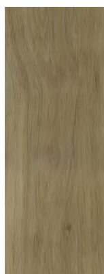
Natural Oak 24831 002