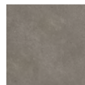
Riverstone 24823 025