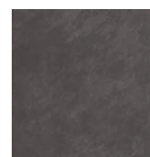
Graphite 24823 024