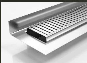
100PPSiMTLF Wall / Floor Flange