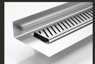
65PASiMTLF Wall / Floor Flange

Stormtech is the only linear drainage system available with full Greentag and Watermark certification across all drainage products.