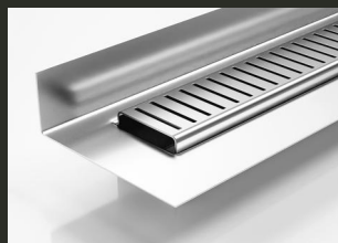
65PPSiMTLF Wall / Floor Flange